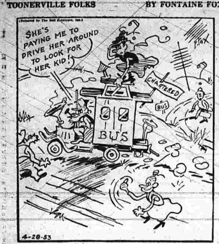
TOUNERVILLE FOLKS BY FONTAINE FOX FUNNY BUSINESS