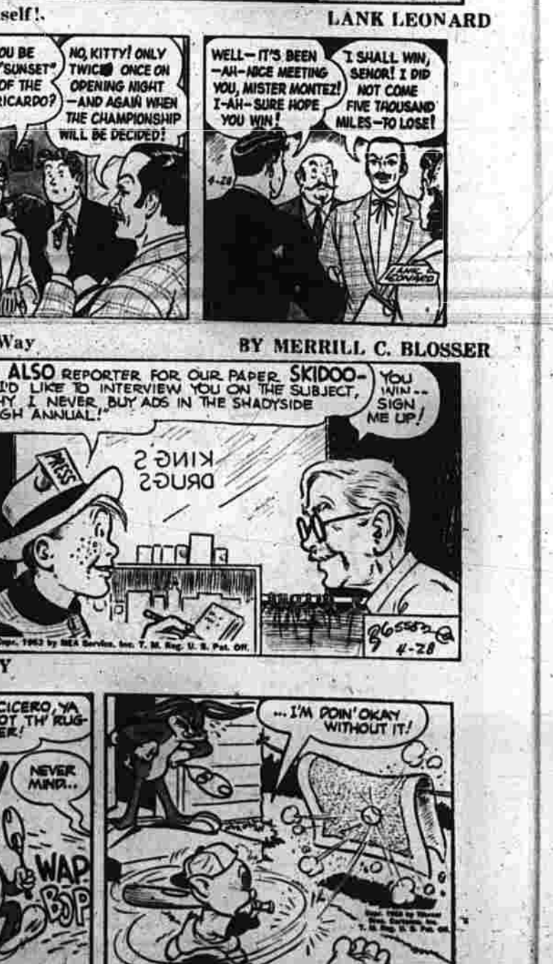
BUGS BUNNY BY MERRILL C. BLOSSER